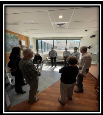
HFM - North Tower Tour – May, 2023