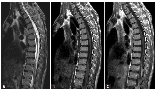
Figure 1: (a) T2 sagittal MRI: extensive loculated fluid collections compressing the spinal cord ventrally at T12-L2 and dorsally at T8-T12 level. Note T2 cord signal change within the distal thoracic cord/conus at T11-T12. (b) T1 sagittal MRI without contrast: anterior displacement of the cord from T9-T12 level. (c) T1 Sagittal MRI with contrast: distinct enhancement of the fluid collections at T8-T12, T12-L2 and leptomeninges/nerve roots in the cauda equina

The patient underwent an emergent laminectomy from T10 to L2. No epidural abscess was seen, but the thecal sac appeared tense. A durotomy started at the L2 level and extended superiorly revealed a lobulated lesion in the intradural space and terminal filum. This phlegmon was