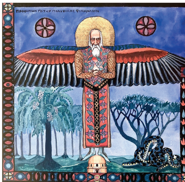
Fig. 2. A spirit guide encountered by Jung during his inner journey, whom he named Philemon. Image from The Red Book by Carl Jung.

The Red Book shows us, visually, what Jung observed and experienced during his inner journey. The inner world experienced by New Agers tends to be safe and pretty. Jung’s experience was different: many of his visions were dark and terrifying. One of his early visions included Europe bathed in a sea of blood. When this vision came