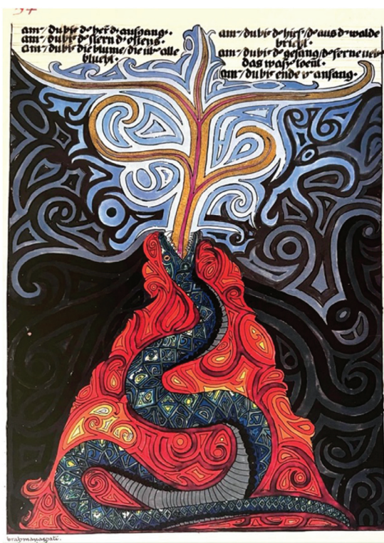
Fig. 1. At age 82, Jung wrote, “In the end, the only events of my life worth telling are those when the imperishable world erupted into this transitory one . . .” 5 Image from The Red Book by Carl Jung.

inventories like the Myers-Briggs Type Indicator, used commonly in industrial psychology, are Jungian in origin.