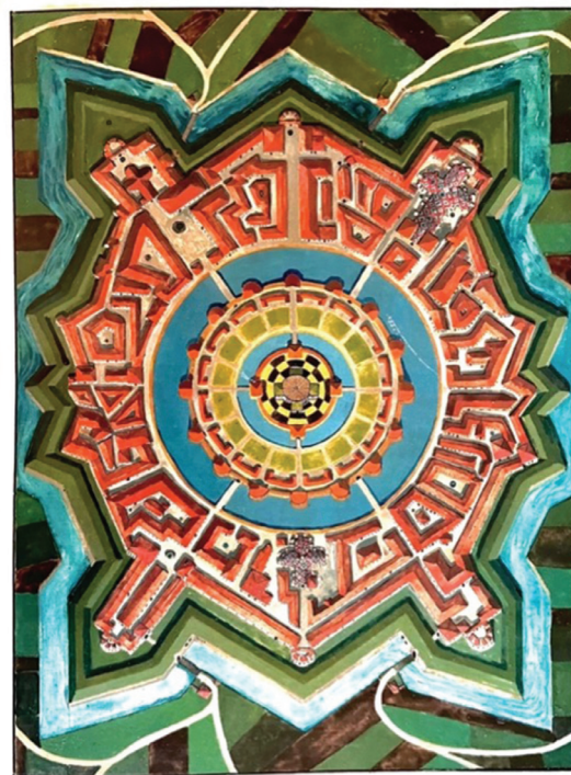
Fig. 3. The Self, an image of inner wholeness combining both conscious and unconscious processes, appears in dreams or active imagination as a circular image, like a primordial mandala, or an archaic symbol of the universe/eternity. Jung termed the teleological process of becoming whole “individuation” and saw the ancient practice of alchemy as a metaphor for the process. He later published a series of dreams of the physicist and Nobel Laureate, Wolfgang Pauli, that reflected this process in Psychology and Alchemy . Image from The Red Book by Carl Jung.

Though Jung’s professional interest soon turned to more esoteric concepts like individuation and the collective unconscious, he always considered himself to be an empiricist or phenomenologist. He insisted that in his work he was describing what he observed through his own experiences.