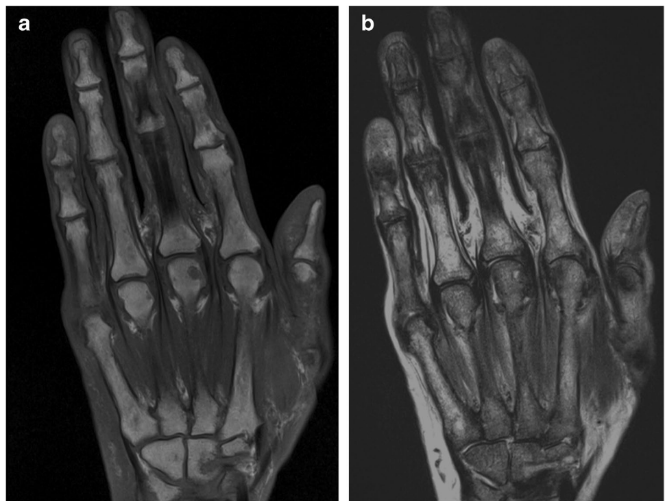
Fig. 1 Coronal MR images of the left hand. (a) Coronal T1W TSE and (b) coronal STIR

The diagnosis can be found at https://doi.org/10.1007/s00256-022-04173-8