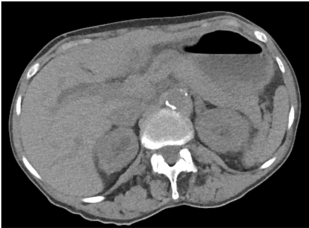
Fig. 2 Axial CT image of the upper abdomen