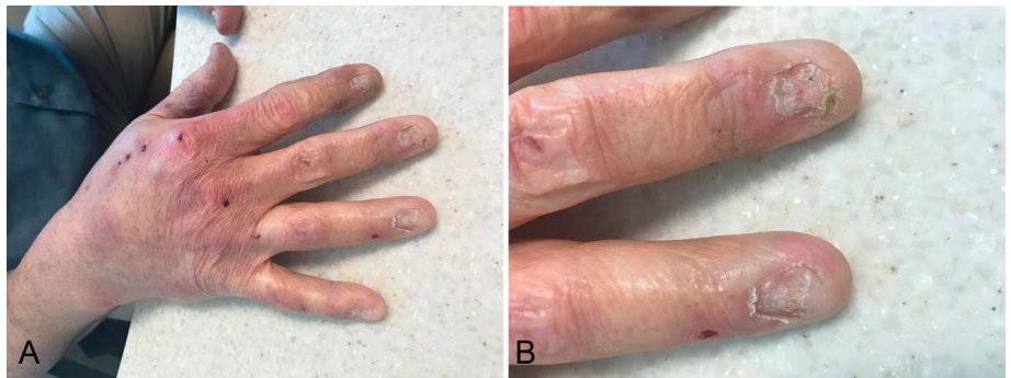
FIGURE 1. Clinical photograph. A, Dorsal hand. B, Close-up of nails.