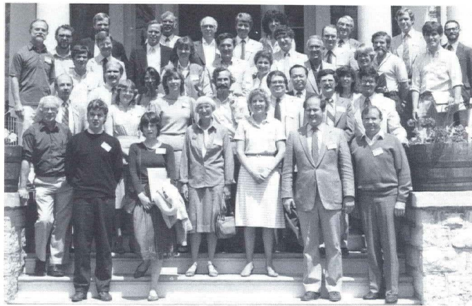
Participants of the First International Workshop on MEN-2 Syndrome, June 1984, Kingston, Ontario, Canada.