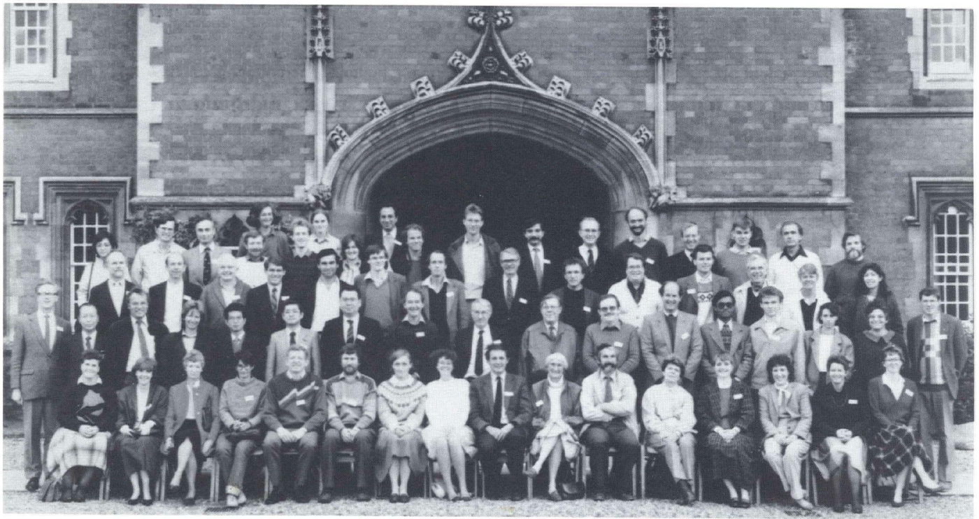
Participants of the Second International Workshop on MEN-2 Syndrome, September 1986, Cambridge, United Kingdom.